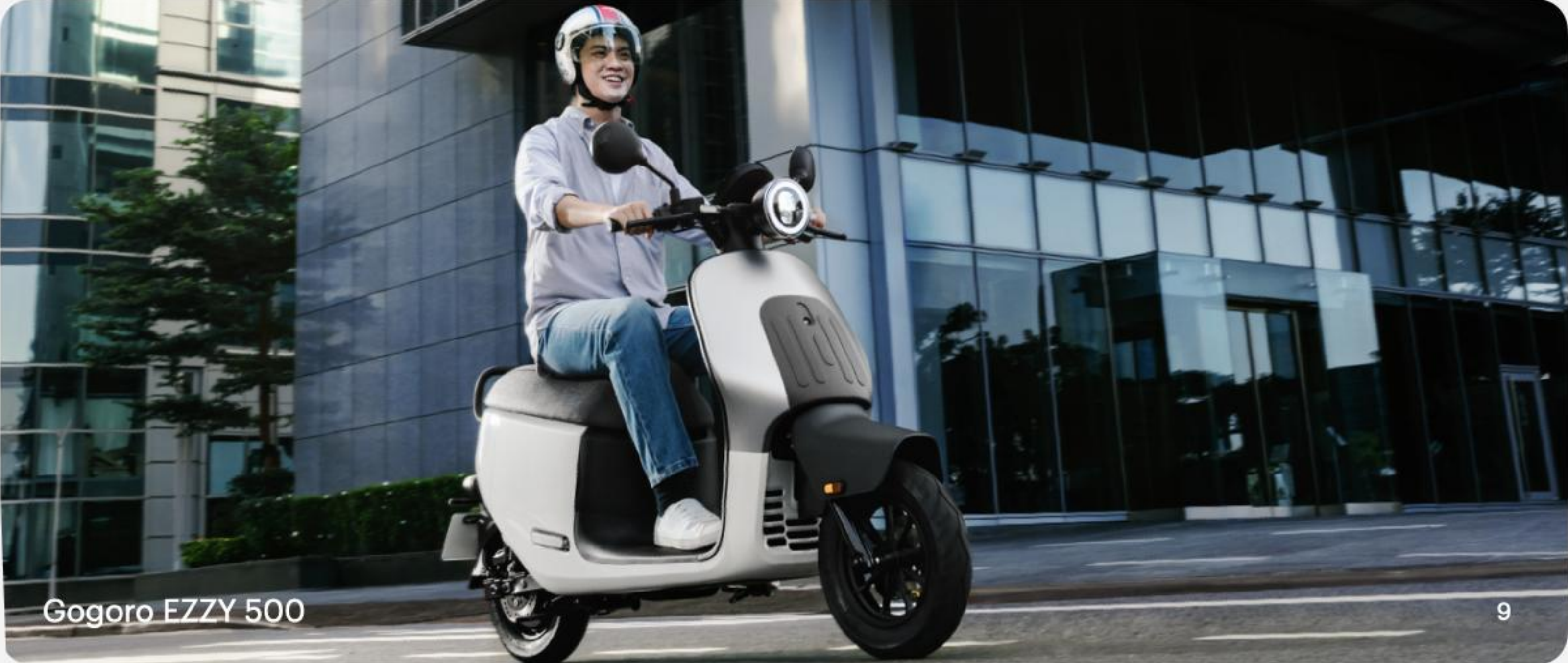
Gogoro EZZY 500